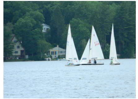
Sailing on Lake Lashaway

Simply fill out the membership form, and mail it along with your check to Lake Lashaway Community Association, Inc., PO Box 72, East Brookfield, MA 01515. Membership is only $50.00 per household for one year, renewable each January.